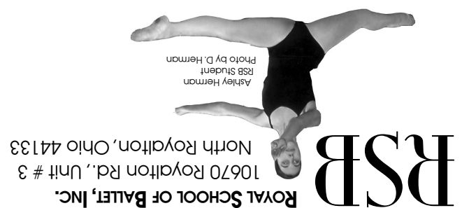
Photo by D. Herman RSB Student Ashley Herman 10670 Royalton Rd., Unit # 3 North Royalton, Ohio 44133